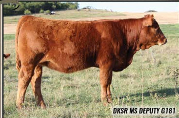
DKSR MS DEPUTY G181