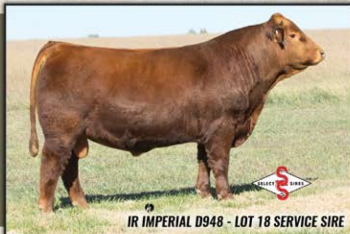
IR IMPERIAL D948 - LOT 18 SERVICE SIRE