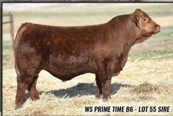
WS PRIME TIME B6 - LOT 55 SIRE