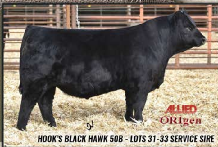
HOOK'S BLACK HAWK 50B - LOTS 31-33 SERVICE SIRE