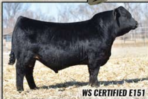
WS CERTIFIED E151