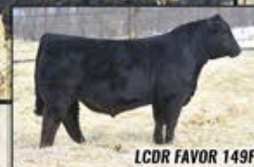
LCDR FAVOR 149F