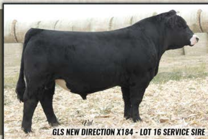
GLS NEW DIRECTION X184 - LOT 16 SERVICE SIRE