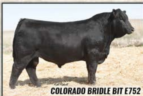
COLORADO BRIDLE BIT E752