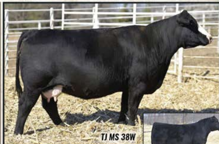
TJ MS 38W

We are excited to offer embryos by the prolific TJ 38W donor and sired by our up-and-coming herd sire, LCDR Favor 149F. Favor is a Witness son and natural calf of the popular C4 donor. This mating not only predicts a breed-leading EPD profile, but also a standout phenotype, possible baldy and intriguing outcross. Doesn't get much more exciting than that!