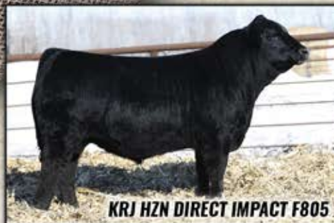
KRJ HZN DIRECT IMPACT F805