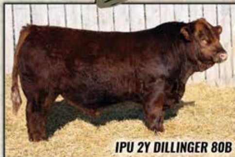
IPU 2Y DILLINGER 80B