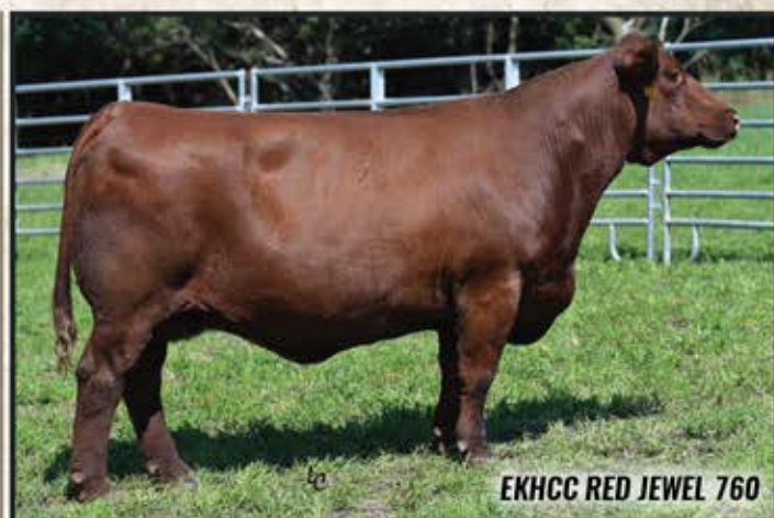
EKHCC RED JEWEL 760

Red Jewel, one of the leading donors in the Simmental breed, needs little introduction, with a daughter selling for $40,000 at the 2018 NAILE Sale and with other offspring topping sales throughout the industry. Here is a chance to buy some embryos out of some of the leading bulls in the Simmental breed with great numbers.