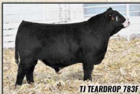
TJ TEARDROP 783F