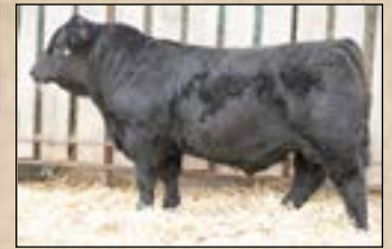
RFS Heyday H48 Sire of Lot 2B