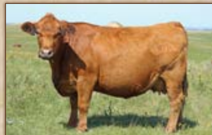
2021 first calf heifer (GW Major Move X KS Penny) in the pasture prior to weaning.