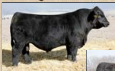
KBHR Honor H060 Sire of Lot 4