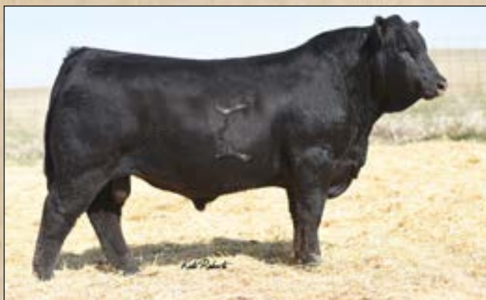
Colorado Bridle Bit E752 • Sire of Lot 45

Consignor: Traxinger Farm This female has been one that we had picked out a year ago for Bismarck. As a calf she exhibited the traits we strive to produce, thick, deep flanked, but yet very feminine. KS Little John females are hard to beat when it comes to cows that produce and the Red Rock calf she is carrying will cover all the angles. AI bred to Bridle Bit Red Rock G9124 (3560970) on 5/9/21. PE to Bridle Bit Red Rock G9124 (3560970) from 5/13/21 to 6/20/21. Safe to AI Date.