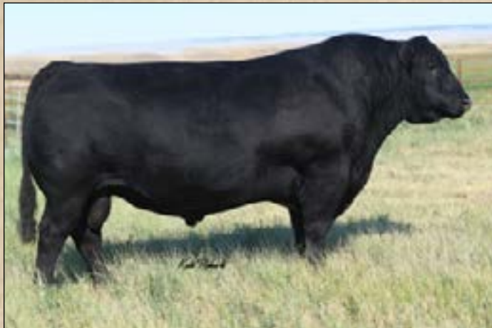
Sydgen Enhance • Sire of Lot 2C