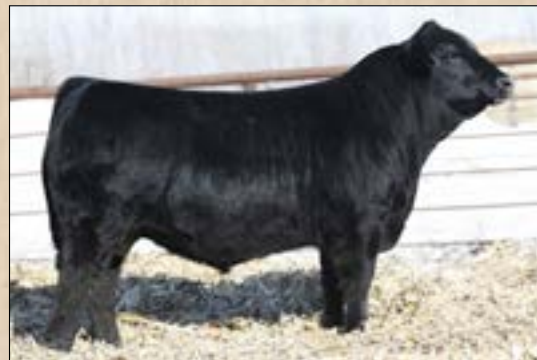
KRJ HZN Direct Impact F805 • Maternal brother to Lot 3