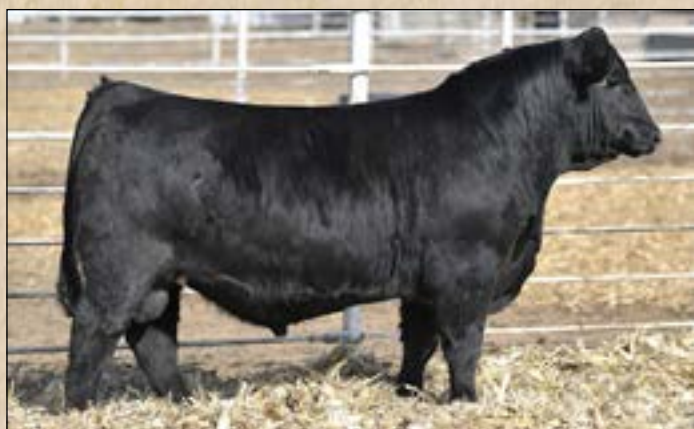
TJ Nebraska 258G • Service Sire of Lot 6