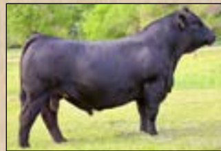
KRJ Dakota Outlaw G974 Sire of Lot 2A