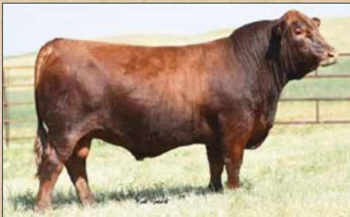
CDI Perception 254E • Service Sire of Lot 22

Consignor: Kunkel Simmentals Here is your chance to get a direct daughter of the great female maker Red Zone. Her dam has females working in several purebred herds already. I don't know where to start talking about her so I will just sum it all up, H143 is going to make a "GREAT" cow. Homo polled test results will be available sale day. AI bred to Bridle Bit Red Rock G9124 (3560970) on 5/14/21. PE to TT Fireball 280B (2859843) from 5/26/21 to 7/15/21. Safe to AI Date and due 2/23/22 with a heifer calf.