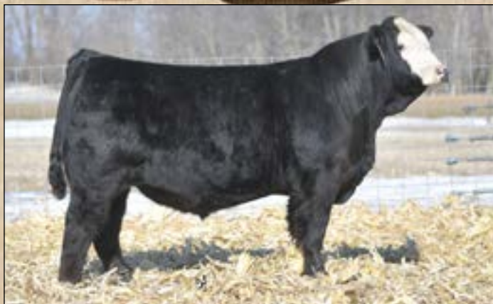
MR SR Highlife G1609 • Service Sire of Lot 33