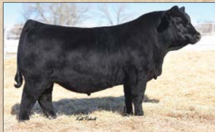
Hook's Eagle 6E • Sire of Lot 59

Consigner: Zimmer Family ZF Lola is out of purebred Simmental cow going back to Club King sire, she just didn't get registered. This is a sound made heifer with good calving ease numbers and yearling weight. Be sure to check her out on sale day.