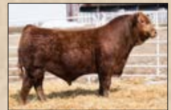
Trax Red River E84 Sire of Lot 3