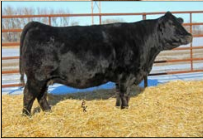
Double J Miss X011 • Dam of Lot 2A, 2B and 2C