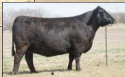
IR Ms Geneva X200 Dam of Lot 4