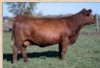
OMF/DK Darling D49 Dam of Lot 3