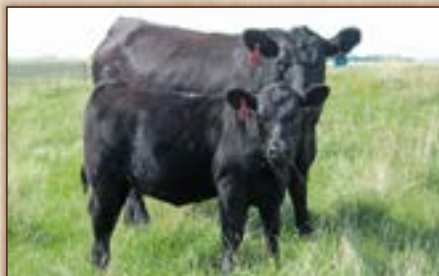
2021 first calf heifer and her IR Klieman heifer calf in the pasture.

Consignor: Kenner Simmental Ranch We are excited to offer the pick of our replacement bred heifers again this year! Just like last year, it does not include the bred heifers in our production sale. There are over 90 heifers to choose from right off the top of our program. All have genomically enhanced EPDs and trait testing completed. Complete ultrasound and breeding data will be available. This is a tremendous set of heifers that we expect to sire bulls that will be in the top of our sale and females to be in the top of the pen. We are strict about udder quality, disposition, foot quality, structure and overall performance. Our females are bred to be easy keepers and for longevity. The buyer will need to pick by January 15, as they will start calving mid-February. A list of heifers is available by request.