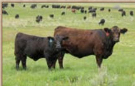
2021 first calf heifer and her CLRS Guardian heifer calf in the pasture.