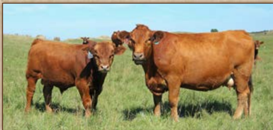
2021 1st calf heifer (GW Major Move daughter) and her KS Triple Play bull calf in the pasture.

Congratulations to the ND Simmental Association on a fantastic 50 years and to a progressive future!