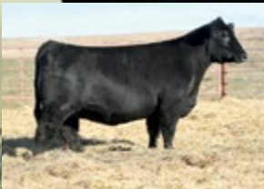
BRED HEIFER - SOLD IN 2021