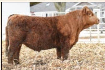
HLTS CAPT. AMERICA E799