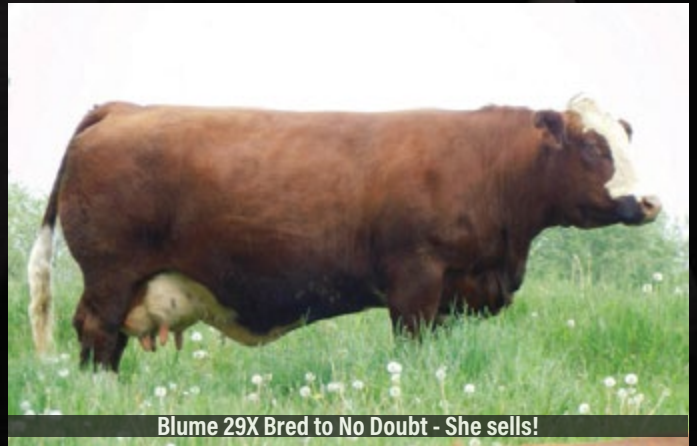
Blume 29X Bred to No Doubt - She sells!

Van De Velde Cattle (MB Producer of the year)