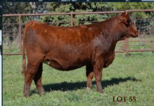
LOT 55 BCLR MISS INTRIGUE H044 • ASA#: 3853628 • PB SM LCDR INTRIGUE 749E X CDI AUTHORITY 77X

1 P.M. - AT THE RANCH LINTON, N.D. 50 Bulls • 45 Bred Females