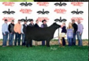
SOLD IN 2017 AS A HEIFER CALF

A SHOW HEIFER SHOULD BE TWO THINGS; THE KIND THAT CAN SHOW; AND THE KIND THAT CAN MAKE A COW.