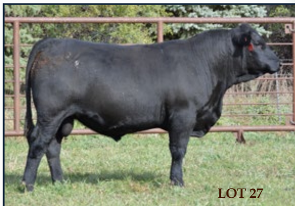
BCLR ARTILLERY H352 • ASA#: 3853700 • PB SM BCLR ARTILLERY E21-3 X GW PREDESTINED 701T