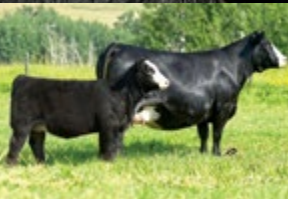
COW SOLD IN 2019 AS A HEIFER CALF - SECOND CALF AT SIDE