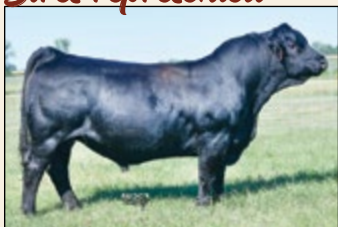
WS CERTIFIED E151