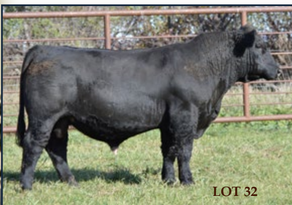
BCLR ARTILLERY H742 • ASA#: 3853713 • PB SM BCLR ARTILLERY E21-3 X BCLR WIDE LOAD C21-3