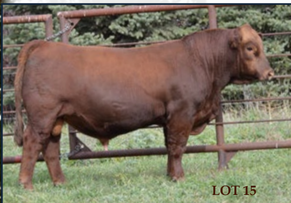
BCLR MOTLEY H622 • ASA#: 3853680 • 3/4 SM 9 MILE MOTLEY 8505 X BCLR SHAMWOW W611