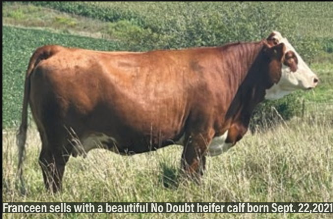
Franceen sells with a beautiful No Doubt heifer calf born Sept. 22, 2021!