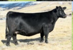
SOLD IN 2018 AS A HEIFER CALF