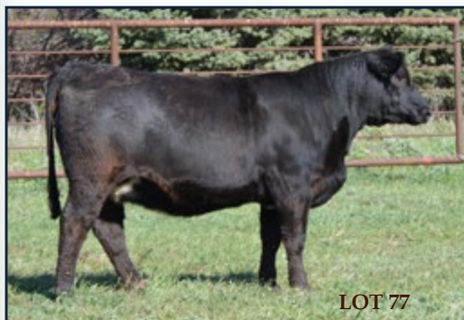
LOT 77 BCLR MISS MAKIN WAVES H038 • ASA#: 3853660 • PB SM LCDR MAKIN WAVES 711E X REMINGTON LOCK N LOAD54U