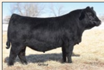
HOOK'S EAGLE 6E