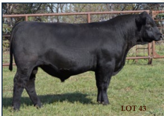
BCLR FIRESTEEL H7044 • ASA#: 3853575 • 3/4 SM EGL FIRESTEEL 103F X REMINGTON LOCK N LOAD54U

DOUG & MARIA BICHLER • Linton, N.D. Home: 701 254-4306 • Cell: 701 226-4068