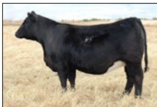
High selling heifers from the 2020 ND Simmental Classic Sale