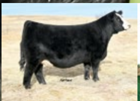
SOLD IN 2020 AS A HEIFER CALF