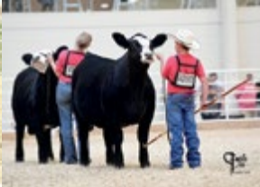
2021 AJSA - 16TH OVERALL PUREBRED FEMALE