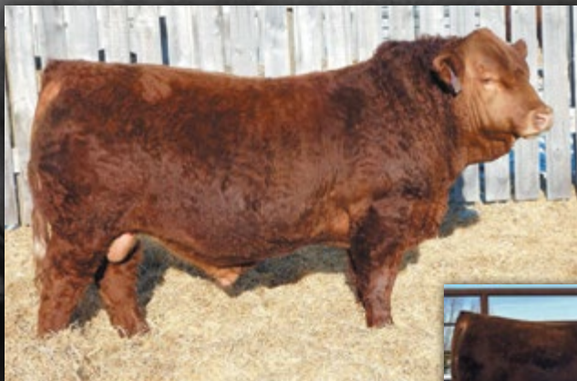
Sunny Valley Thunder 56G • Selling Sons

Don't miss our bred heifer consignments in the North Dakota Classic Sale, December 11, 2021, Mandan, ND Visit our Facebook page for more information!