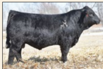
KINNS MEGA WIDE 3316E