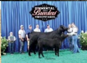
THE IMPACT OF SECRET WEAPON PROGENY