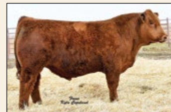
WS ALL ABOARD B80

This set of heifers is from the very heart of our herd and will make outstanding cows for any operation. We have sorted them into groups of 5 and will sell as the complete group. Each group is made up of similar genetics so that if you like one, odds are you'll like the other 4 too, both for phenotype and genotype. We also decided to sell 5 as individuals to help the smaller operator or first-time buyer who may not want or need 5 head.