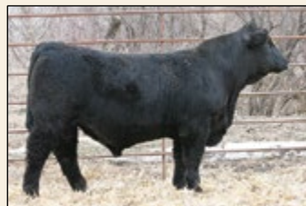
STAV GRANDSTAND 14F