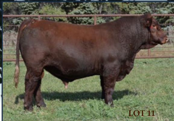
BCLR FIERCE H384 • ASA#: 3853595 • PB SM LCDR/CDI FIERCE 81E X DIKEMANS SURE BET