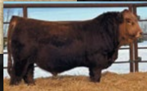
Erixon Hatfield 12H

RAISING OUTCROSS PERFORMANCE SIMMENTAL GENETICS FOR OVER 50 YEARS!