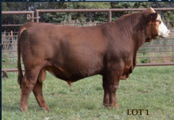
BCLR INTRIGUE H704 • ASA#: 3853703 • PB SM LCDR INTRIGUE 749E X REMINGTON LOCK N LOAD54U