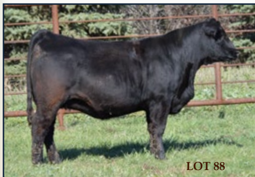
LOT 88 BCLR MISS MAKIN WAVES H014 • ASA#: 3853688 • 5/8 SM LCDR MAKIN WAVES 711E X S A V BRILLIANCE 8077