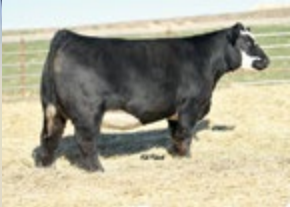
BRED HEIFER - SOLD IN 2021