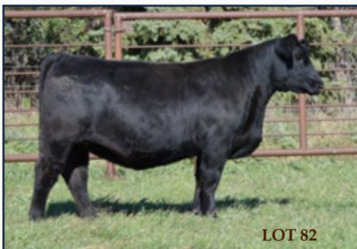
LOT 82 BCLR MISS MOTLEY H039 • ASA#: 3853705 • 3/4 SM 9 MILE MOTLEY 8505 X CCR ABILENE 6018C