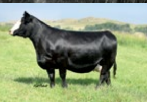
SOLD IN 2019 AS A HEIFER CALF