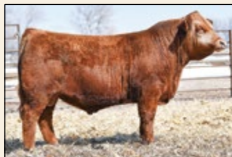
GB/SAS RED VIPER F634