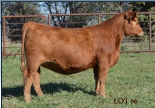
LOT 66 BCLR MISS MOTLEY H074 • ASA#: 3853687 • 1/2 SM 9 MILE MOTLEY 8505 X CDI AUTHORITY 77X