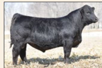
STAV PIPELINE 4E