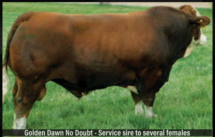
Golden Dawn No Doubt - Service sire to several females