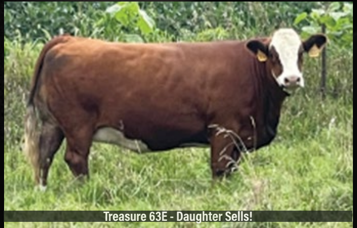
Treasure 63E - Daughter Sells!