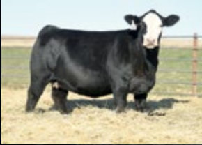
BRED HEIFER - SOLD IN 2021 SOLD IN 2019 AS A HEIFER CALF

Our only offering in 2021 of bred and open females