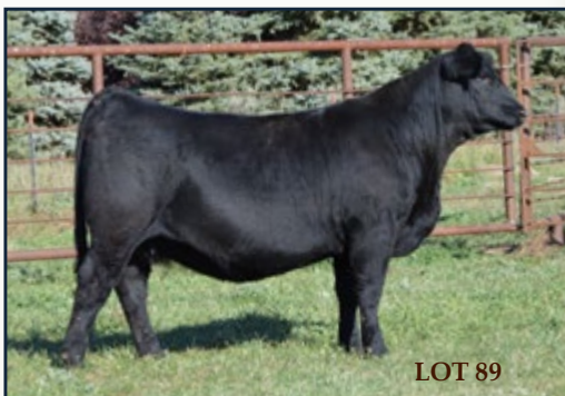
LOT 89 BCLR MISS MAKIN WAVES H063 • ASA#: 3853620 • 5/8 SM LCDR MAKIN WAVES 711E X S A V 004 DENSITY 4336