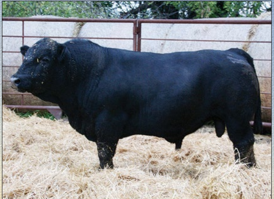
H214 - A73 grandson

Age-advantage bulls • Free bull keep until December 31 • Free bull delivery within 500 miles