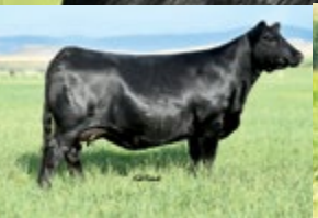
SOLD IN 2019 AS A HEIFER CALF